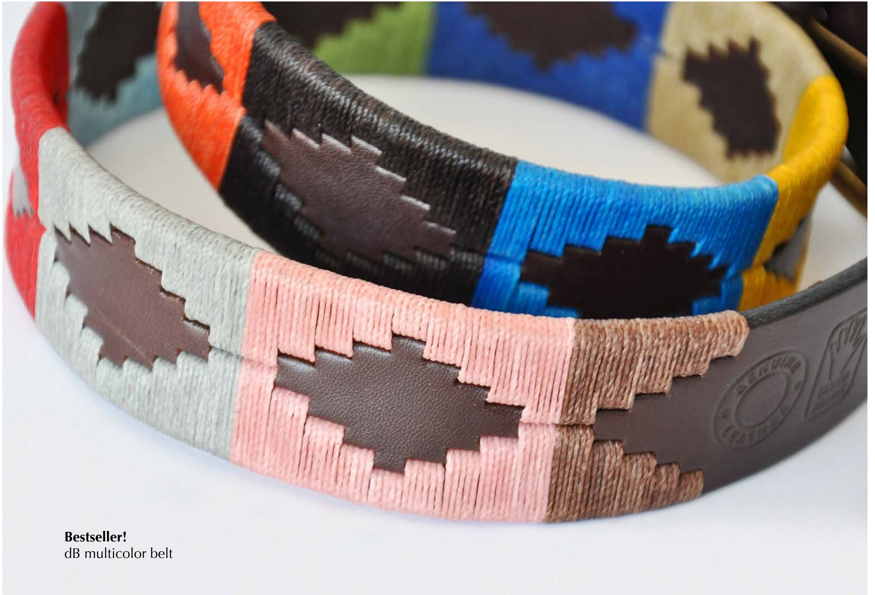
Bestseller! dB multicolor belt